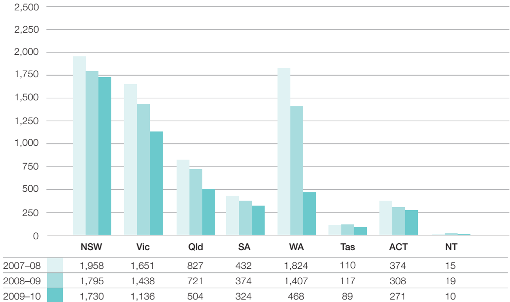
Table A3.7 Alternative dispute resolution processes, interlocutory hearings and hearings conducted by the Tribunal