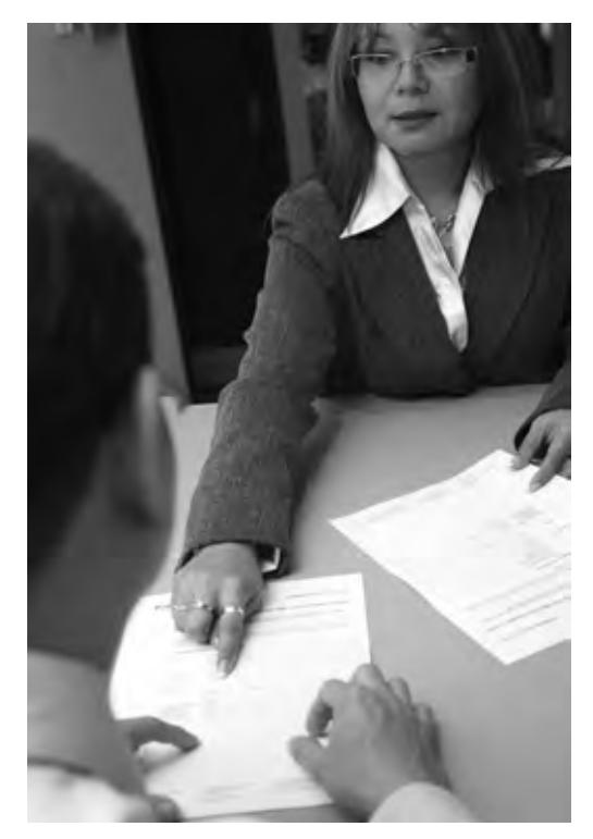
District registry staff assist applicants and other parties as well as the general public.

Principal Registry staff are in Brisbane, Perth and Sydney.