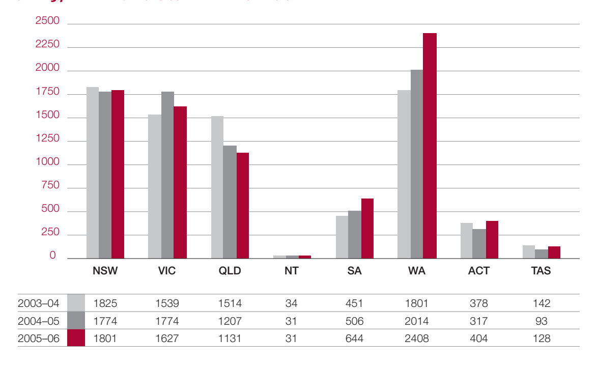
TABLE 3.8 CONSTITUTION OF TRIBUNALS FOR HEARINGS