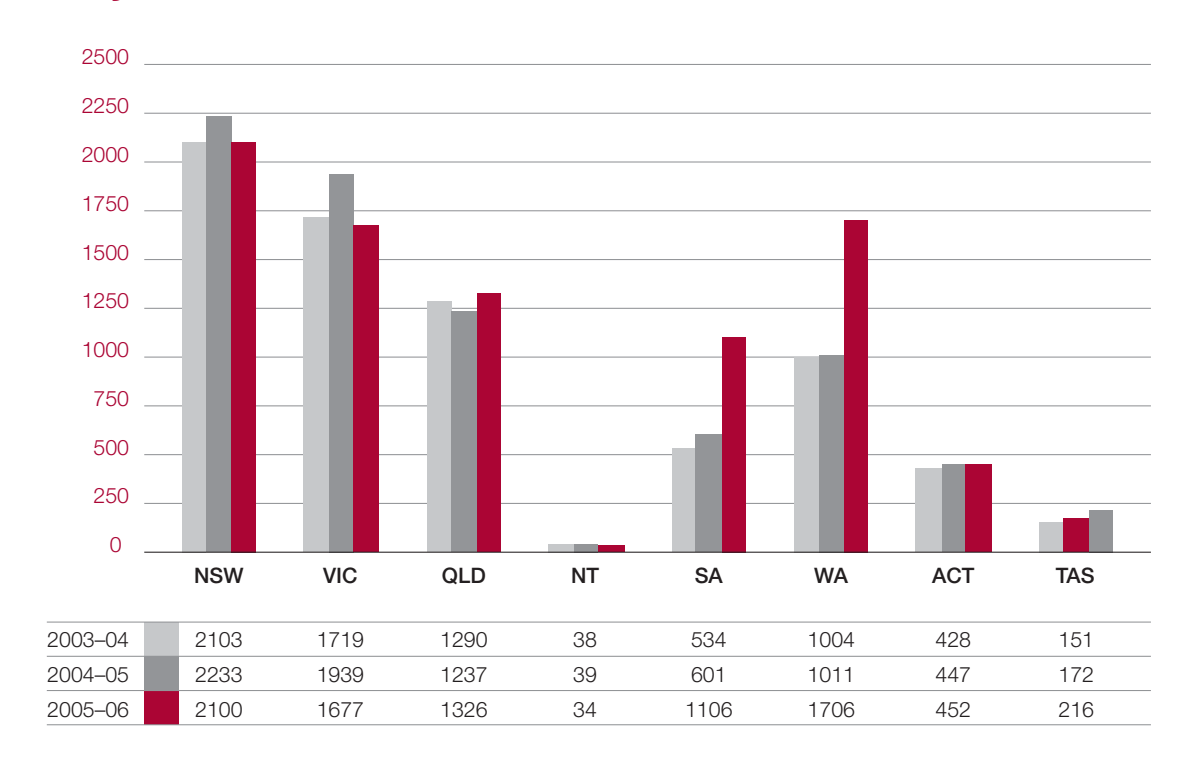
CHART 3.3 APPLICATIONS FINALISED IN EACH REGISTRY