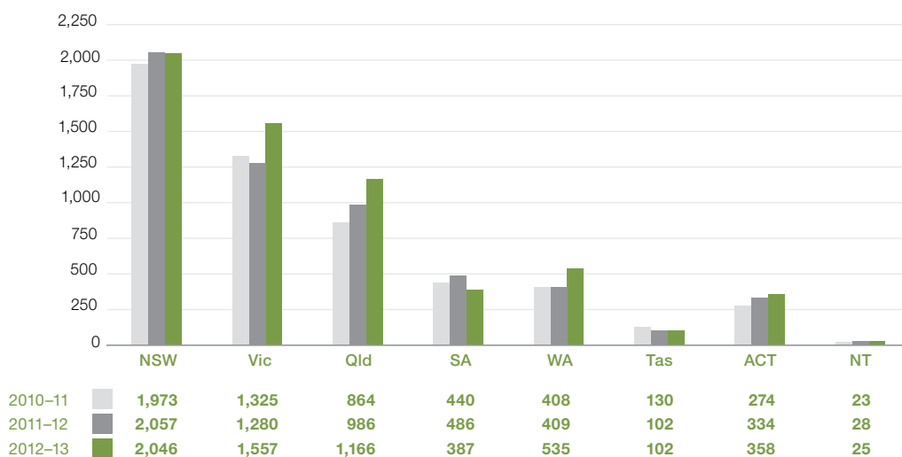
Chart A4.2 Applications lodged – By state and territory

a Percentages do not total 100% due to rounding.