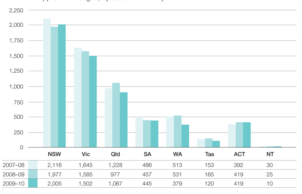
Chart A3.2 Applications lodged, by state and territory