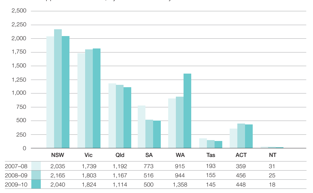
Chart A3.3 Applications finalised, by state and territory