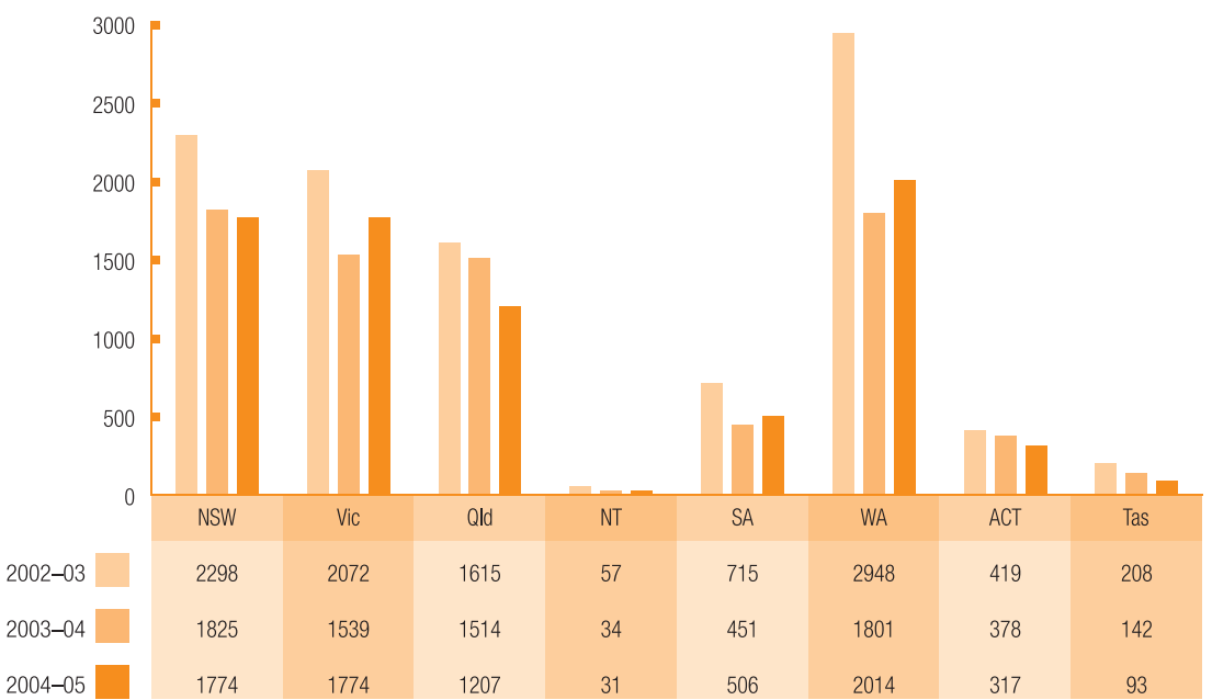
Chart 3.7 Applications current in each registry