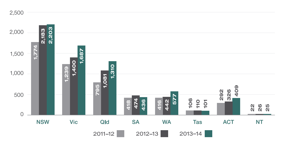
Chart A4.3 Applications finalised - By state and territory