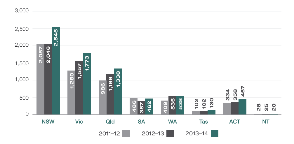
Chart A4.2 Applications lodged – By state and territory

a Percentages do not total 100% due to rounding.